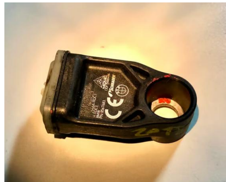
Figure 2: The newer "Gen 2" style sensor.