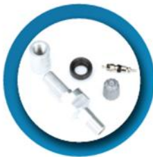
90° Aluminum Straight Stem #25080