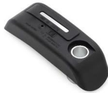
Figure 1: The OEM "banana style" sensor.

At some point (circa 2018?) Schrader develops, and BMW adopts, a new style ("Gen 2") sensor to replace the banana style ("Gen 1") sensors. BMW dealers may only have the Gen 2 sensors available now as replacements as the Gen 1 sensors have been superseded. The Gen 2 sensors are lighter than the Gen 1 and have less impact on wheel balance.