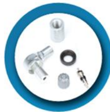
90° Aluminum Angled Stem #25078