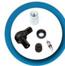
90° Black Angled Stem #25082

Includes: plastic sealing cap, aluminum clamp-in stem, nickel-plated valve core, nut and rubber grommet