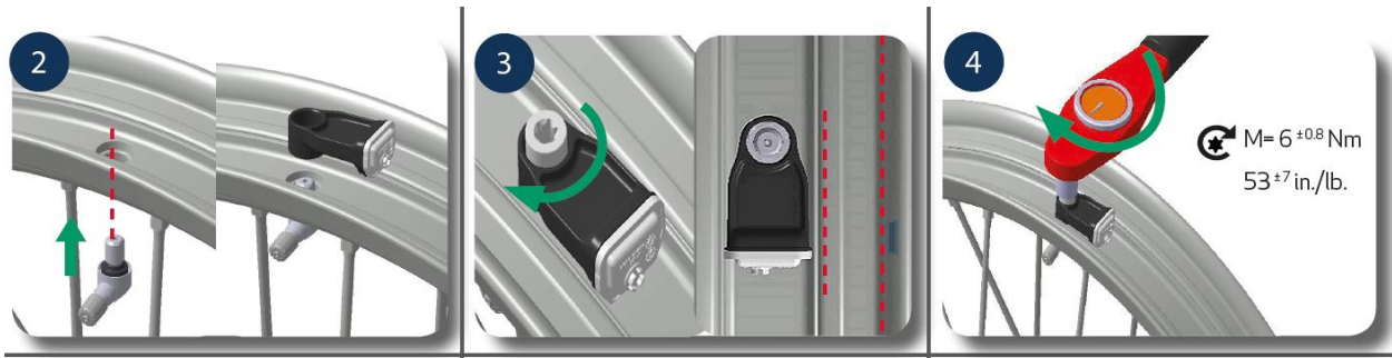
Figure 6: Installation procedure. Note the torque spec.

The installation procedure (angled valve stem shown):