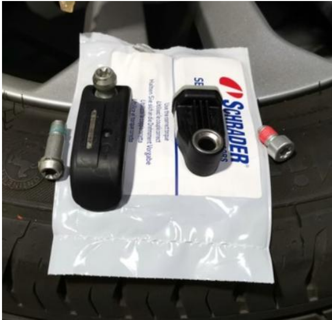
Figure 3: Gen 1 and Gen 2 side by side.

Schrader has developed an aftermarket pre-programmed tire pressure sensor as a replacement for the BMW motorcycle OEM part. It is the Schrader 3141M. The 3141M is pre-programmed to work with BMW motorcycles and it is identical to the BMW Gen 2 part save for the BMW logo. The 3141M and the BMW replacement part use a different form factor than the original “banana style” BMW sensor (as is evident in the previous photos) and has a different mounting scheme.