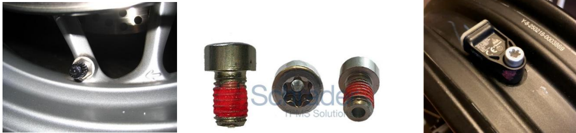
Figure 9: The valve in spoke configuration used in cast some cast wheels.

The screw is BMW part number 36318359961 or Schrader part number 5081M: