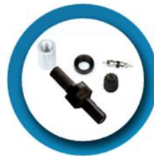
90° Black Straight Stem #25083