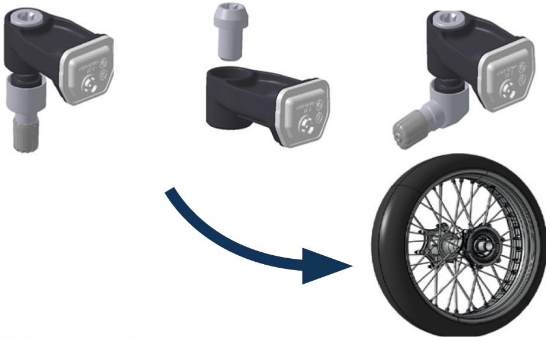
Figure 4: Gen 2 sensor mounting schemes.

Depending on the model, BMW may have used either a straight valve stem (the one on the left above) or an angled valve stem (the one on the right above) on wheels where the valve hole is in the middle of the rim. The angled valve stem is advantageous where access space for the air hose chuck is limited due to the brake rotors. The angled valve stem may be substituted for the straight valve stem.